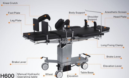
HFMH600 Manual Hydraulic Operating Table