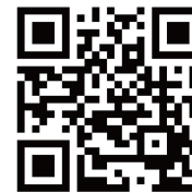
Official QR code

all has its domestic sales amount coming out at the top and some products have ready sale in Southeast Asia. Its products can be found in all the domestic markets in China and also are sold abroad.